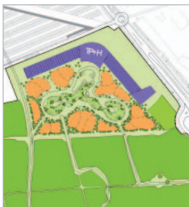
Relax & Heal

Finally, in 'World Show Stage' horticulture is the source of inspiration for art, culture and entertainment. Nature and culture are closely related. International art, culture and entertainment inspire the horticultural sector and vice versa. World Show Stage is a meeting place for different cultures. Its design is intensive and playful. Water also plays an important role here. Water connects the different continents and is the common source of all life. A colourful theme field with ample space for people to really meet each other.