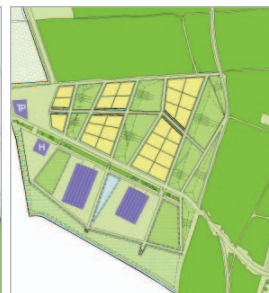
Education & Innovation