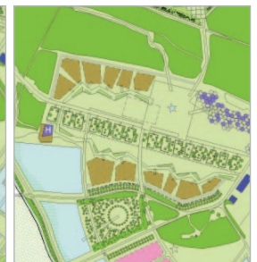
World Show Stage